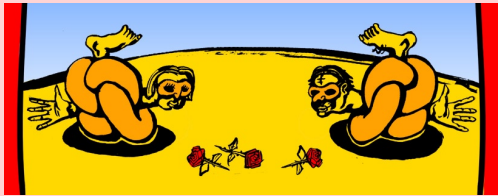
"Wound Up" Graphics by Sylvan Hamburger (2019)

In December 2019 Theatre In the Raw produced "Wound Up in One-Acts" a set of original award winning one-acts from gifted writers. This one-act play mini-fest was a presentation of fine theatrical talent that spirals back to those early days of the company and embodies Theatre In the Raw's commitment to present engaging, unusual, awakening, and exchanging evenings of theatre. Featuring over 20 performers and artists, this intimate four night presentation featured a rotating lineup of original one-acts for four nights. This was our second production of one-acts at Spartacus Books (3378 Findlay Street, Vancouver BC).