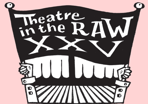
TITR - 25 th Anniversary logo by Maurice Spira

— Kirk Douglas (1916-2020) quoted in The Very Best of Kirk Douglas: Thoughts of a Hollywood Legend